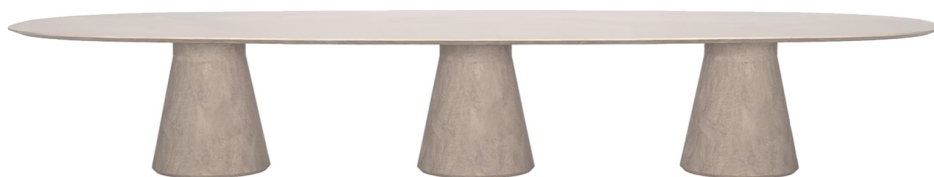
Table with elliptical cement top and 3 polyethylene base.