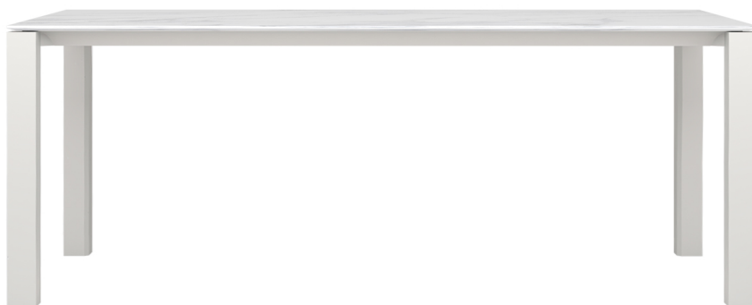
Table with Calacatta marble table top and aluminum legs.