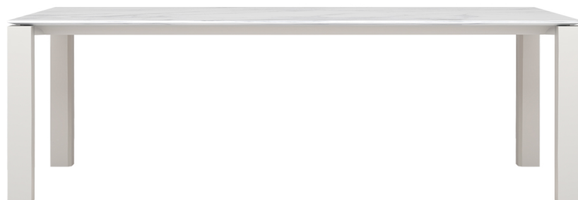
Table with Calacatta marble table top and aluminum legs.