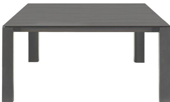
Table of squared Ivory/black linoleum top and with squared aluminum legs.