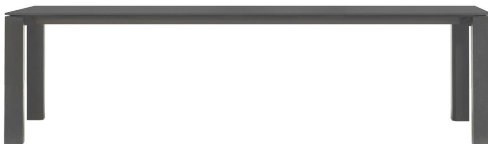
Table of rectangular Ivory/black linoleum top and with squared aluminum legs.