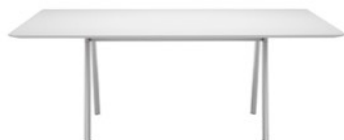
Table with beveled edge profile lacquered board table top and aluminum legs.