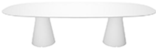
Table with laminated board table top and thermo-polymer matching edge and 2 polyethylene central base. Optional bright lacquer base finish.