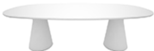
Table with laminated board table top and thermo-polymer matching edge and 2 polyethylene central base. Optional bright lacquer base finish.