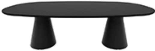
Table with Dekton top and thermo-polymer machining edge and 2 polyethylene central base. Optional bright lacquer base finish.