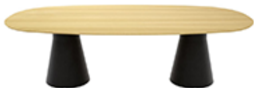
Table with laminated board table top and 2 polyethylene central bases. Optional bright lacquer base finish.