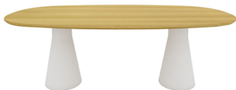
Table with laminated board table top and polyethylene central base. Optional bright lacquer base finish.