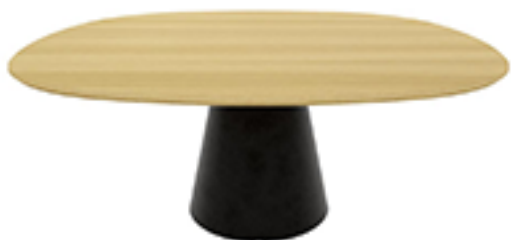
Table with elliptical oak board table top and polyethylene central base. Optional bright lacquer base finish.