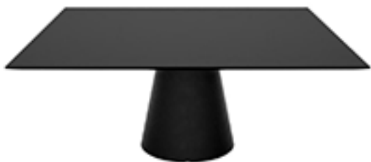
Table with square lacquered board table top and polyethylene central base. Optional bright lacquer base finish.