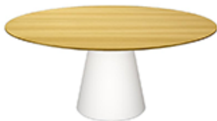
Table with round oak board table top and polyethylene central base. Optional bright lacquer base finish.