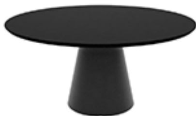
Table with round oak board table top and polyethylene central base. Optional bright lacquer base finish.