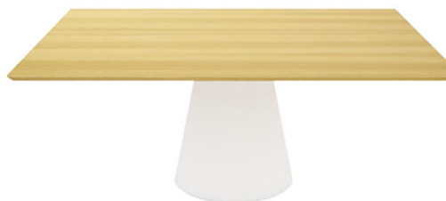
Table with square oak board table top and polyethylene central base. Optional bright lacquer base finish.