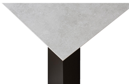
Table with ceramic top and aluminum legs.