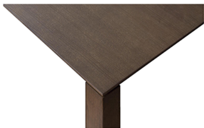
Table with oak board table top and solid oak wood legs.