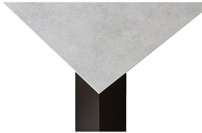
Table with ceramic top and aluminum legs.