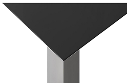
Table with lacquered top and aluminum legs.