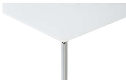
Table with low-iron glass top and aluminum delta legs.