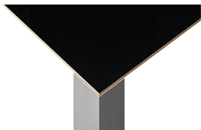
Table with laminate board table top and aluminum legs.