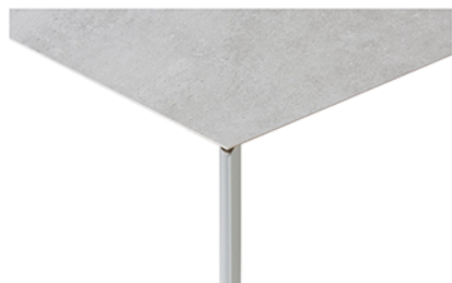
Table with ceramic top and aluminum delta legs.