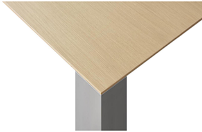
Table with oak board table top and aluminum legs.