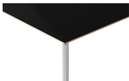
Table with laminate board table top and aluminum delta legs.