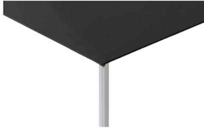
Table with lacquered top and aluminum delta legs.