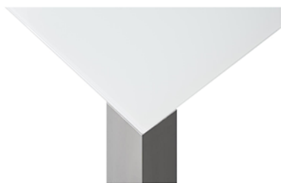
Table with low-iron glass top and aluminum legs.