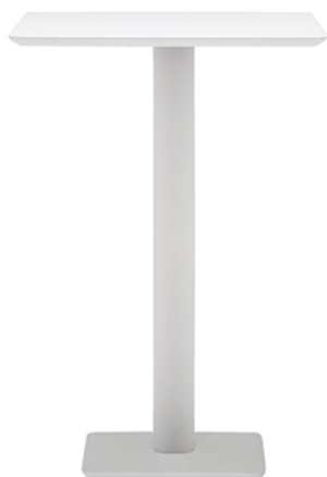
Table base with solid beech round central column and square injected aluminum base with matte white finish. Able to be combined with any model from the Top Collection.