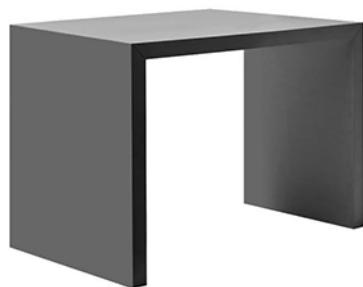
Table with top and legs in laminate HPL.