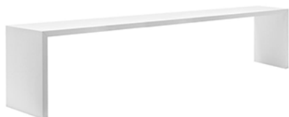
Table with top and legs in lacquered finish.