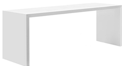
Table with top and legs in lacquered finish.