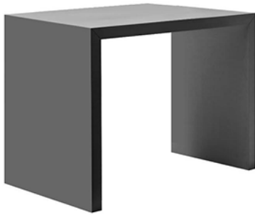
Table with top and legs in laminate HPL.