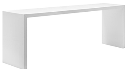
Table with top and legs in lacquered finish.