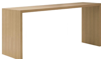
Table with solid oak wood top and legs.