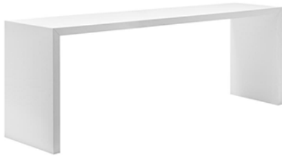
Table with top and legs in lacquered finish.