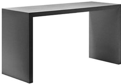
Table with top and legs in laminate HPL.