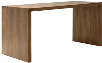
Table with solid walnut wood top and legs.