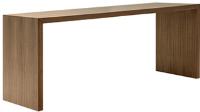
Table with solid walnut wood top and legs.