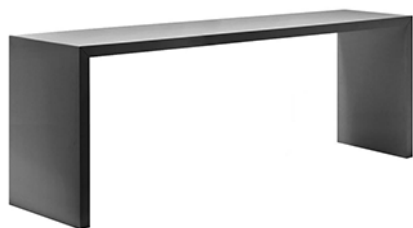
Table with top and legs in laminate HPL.