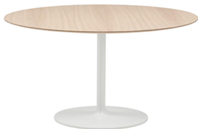
Table base with round base and injected aluminum oval column in matte white or matte black finish. Combinable with all Top collection models.