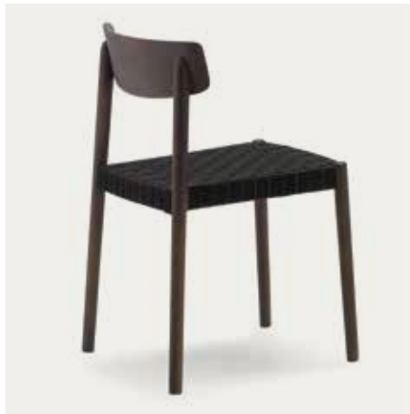
Woven band on seat: SI 0612 Black woven band on seat and 372 or 381 wood finish.