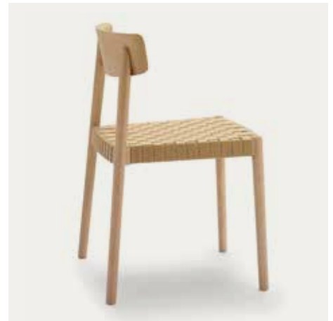
Woven band on seat: SI 0612 Seat with woven band to the tone. Available in 311 finish.