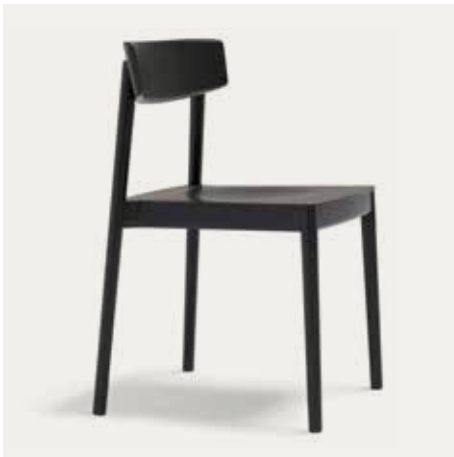
Wood version: SI 0610 Solid oak board seat. Available in 3 finishes: 311, 372, or 381.